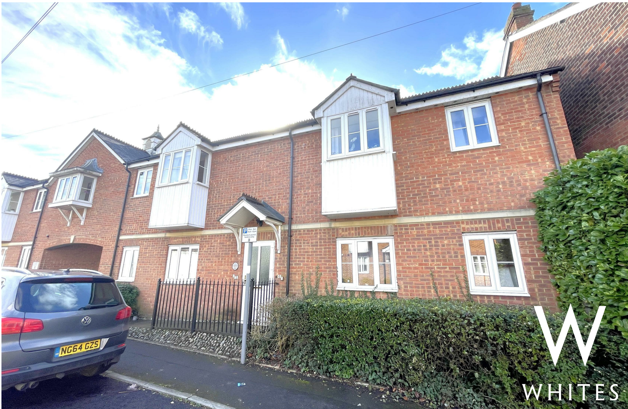
Flat 3, Railway Court Windsor Road, Salisbury, Wiltshire, SP2 7AR